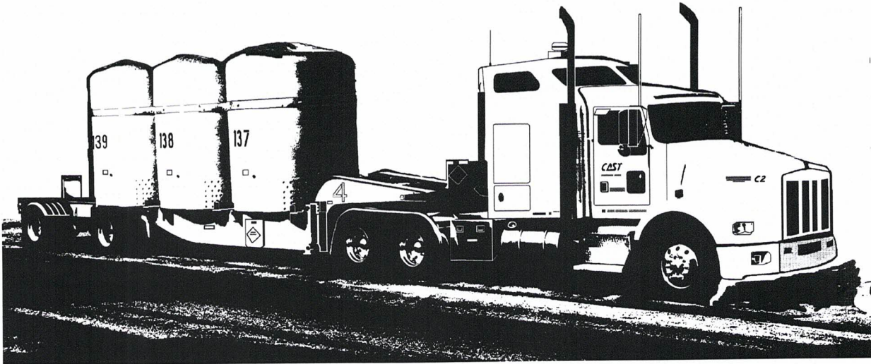
Figure 2 Cutaway of TRUPACT II Container